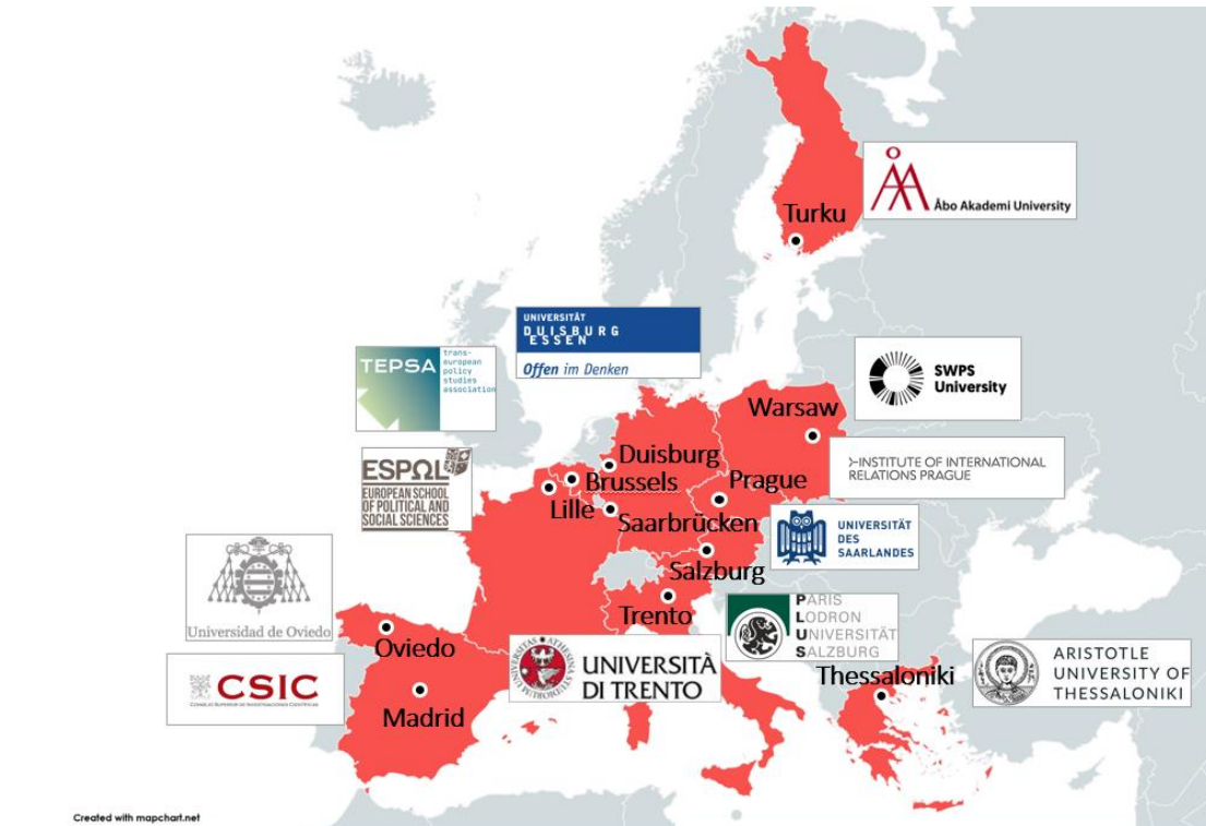
Figure 2: The ActEU Consortium, Source: www.acteu.org

SWPS Uniwersytet Humanistycznospoleczny (SWPS), Universidad De Oviedo (UNIOVI) and Consejo Superior de Investigaciones Científicas (CSIC). See Figure 2 for locations and Table 1 for the identities of the Principle Investigators for each country.