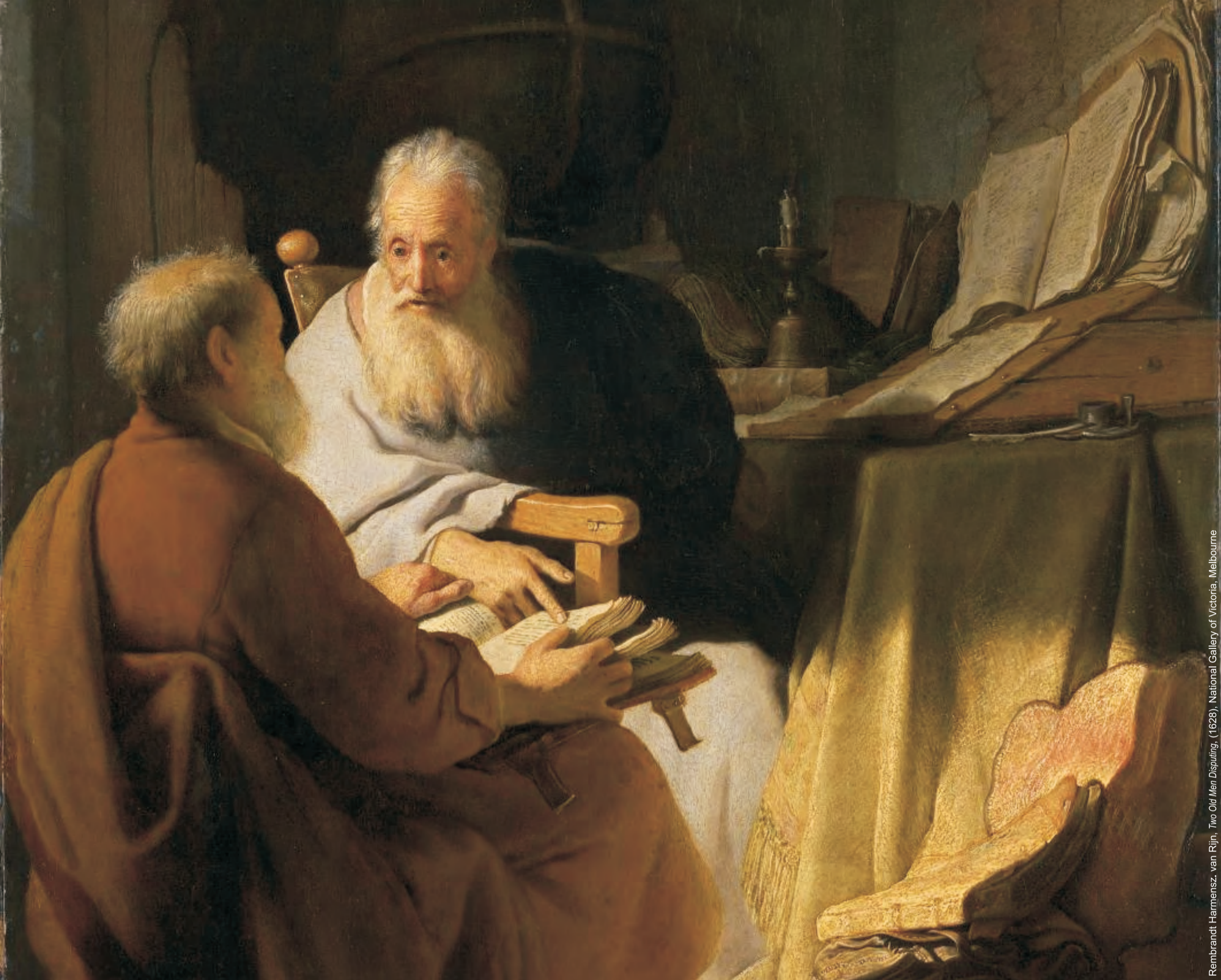
Rembrandt Harmensz. van Rijn, Two Old Men Disputing , (1628), National Gallery of Victoria, Melbourne